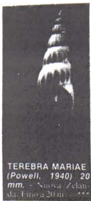
TEREBRA MARIAE (Powell, 1940) 20 mm. - Nuova Zelan- da. Fines 20 m. ***