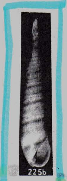
225b. Lectotype of T. traillii Deshayes, British Museum (N.H.) No.1979114: 23.8 mm. BRAT 8+

200. traillii , Terebra - DESHAYES, 1859, P. Z. S. L., p. 285. Hab. Vasigapatam, Océan Indien ("Madrass Presidency, India" on label). Coll. Cuming. Size: 23x4½ mm. Lectotype: 23.8x4.6 mm; syntypes: 24.9 mm, 24.2 mm, and 22.4 mm. C69