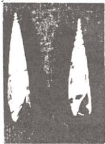
Figure 42 : X15 Hastula stylata (Hinds, 1844)

à gauche : Lagon de Mahina (Tahiti) 37 mm à droite ; Lagon de Afaahiti (Tahiti) 32 mm