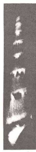
49 Figure 49: Hastula stylata (HINDS). Fiji. x 2.0

Rare. Distribution: Southwest Viti Levu. - From the Philippine Islands to Japan and Fiji. CERN. Tol F p 63-64