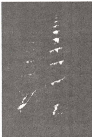
Wide-mouth Auger (1.7") 4.5 cm Hastula stylata (Hinds, 1844). Indo-Pacific. On sand, shallow water; uncommon. Aperture conspicuously dilated.

à gauche : Lagon de Mahina (Tahiti) 37 mm à droite ; Lagon de Afaahiti (Tahiti) 32 mm