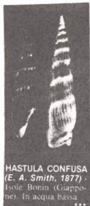
AUBRY P 27