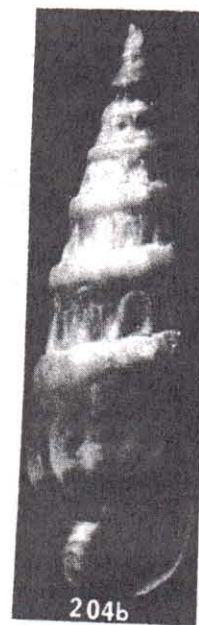
204a-c, T. brevicula Deshayes. 204a,b, Probable syntypes, British Museum (N.H.) No. 197985; 25.6 mm and 21.6 mm respectively.