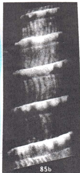
85a,b, T. blanda Deshayes. 85a, Holotype British Museum (N.H.) No. 197984; 29.9 mm. 85b, Middle whorls.