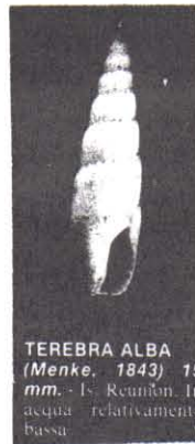
TEREBRA ALBA (Menke, 1843) 15 mm. - Is. Reunion. In acqua relativamente bassa.